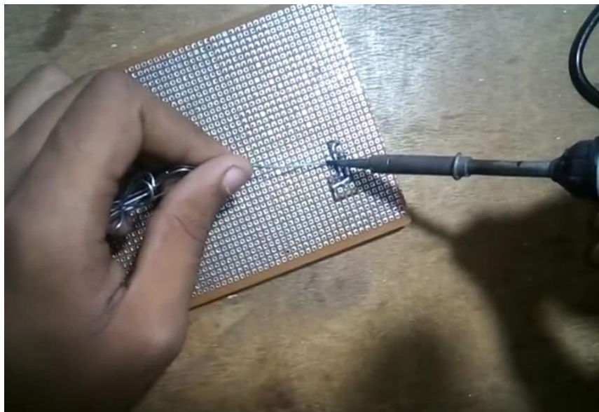
Participant soldering on pcb board

This Event was conducted to develop knowledge of participants in PCB circuit designing through a hands-on soldering session and then a competition.